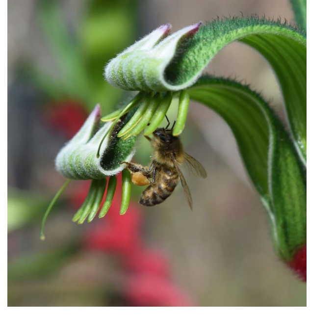
Honeybee on Kangaroo Paw by Bronwyn Ayres

It is only through detailed studies such as this that we can possibly understand the complexity of the natural world.