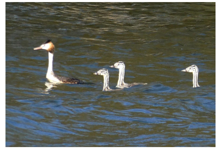
Great Crested Grebes on Lake Wyangan

There is not a huge number of birds here but on a recent visit highlights were the White-bellied Sea-Eagle, almost 100 Whiskered Tern and 7 Great Crested Grebes (one with 3 chicks). Also I witnessed a fight between two foxes, one