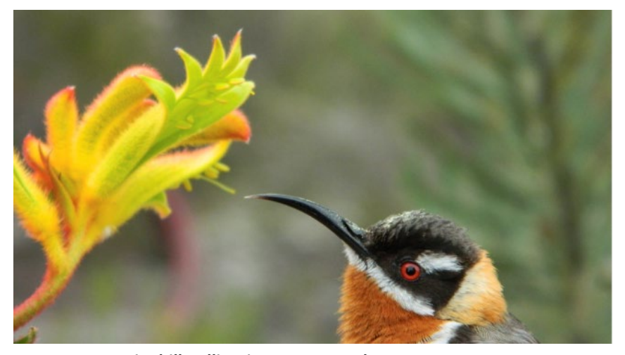
Spinebill pollinating a Cats Paw by Bronwyn Ayre Note the pollen on top of its head.

Honeybees were introduced into Australia in 1822 and formal records show the Honeybees visit 130 Native plants so there is still plenty of research on other species to be carried out. In 1882 Charles Darwin said that Honeybees in Australia were 'rapidly exterminating the small, stingless