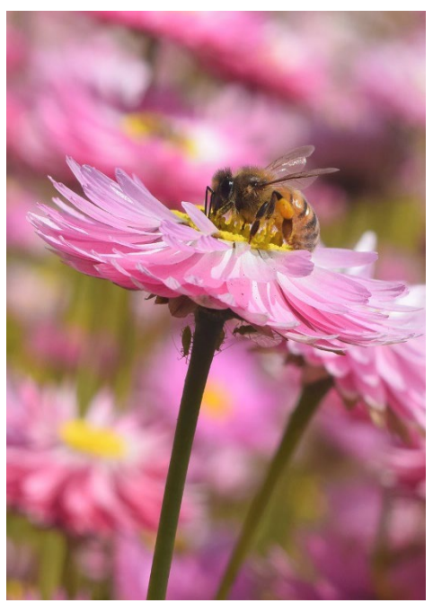
Honeybee on Paper Daisy, Kings Park

She found they could also be lowering genetic diversity and seed production. These results came about after many hours of monitoring and genetic testing.