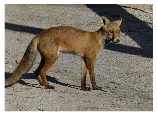
The loser of the fox fight on the Causeway

Come late October 2022 the new multi-million dollar raised Causeway was complete and finally opened, and then it bucketed again. This time the bulk of the water came off the farms to the north, spilling the north lake into the south lake ... but it rose and rose, reaching a metre above road level by November, and the road has remained closed since. Serious concrete bollards stop even the silliest 4WD'ers. The relatively new pump and pipe along Jones Rd to the Lakesview Canal remained silent.