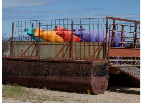
Art in the Landscape: Water tank, coloured cows, fish trees