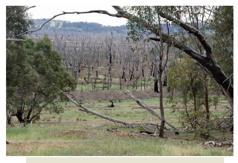
Winton Wetlands Dead Timber in former dam

The first day was very windy and not a good birding day. On arriving at the Mokoan Hub we were presently surprised to find a bird list, map and a very nice café on site. We enjoyed a coffee at the café which seemed to be well