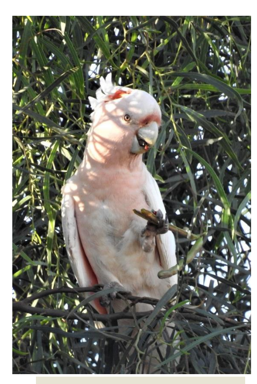
Major Mitchell's Cockatoo

Email: murrumbidgeefieldnaturalists@gmail.com.