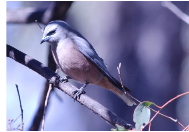
Wandering through the bush (prev page) – Virginia Tarr White-browed Woodswallow (female) – Graham Russell Wylong Wattle Acacia cardiophylla Virginia Tarr

had finished watching the Woodswallows we found our way back to the water way and continued along its course until we could see the fence at the south western corner.