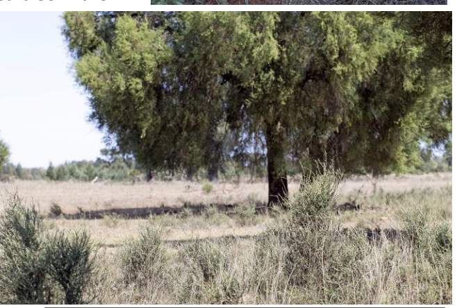
Bird Watching at Red Tank Dam – Dionee Russell Blue Bonnets – Graham Russell