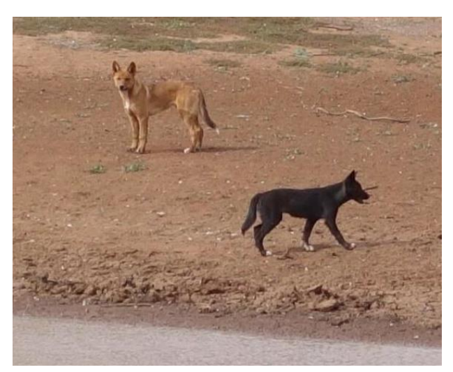
Dingos Striated Pardalote Red-winged Parrot

the cooler. Once located we managed to get clean cool air inside while the dust filled up the verandah area.