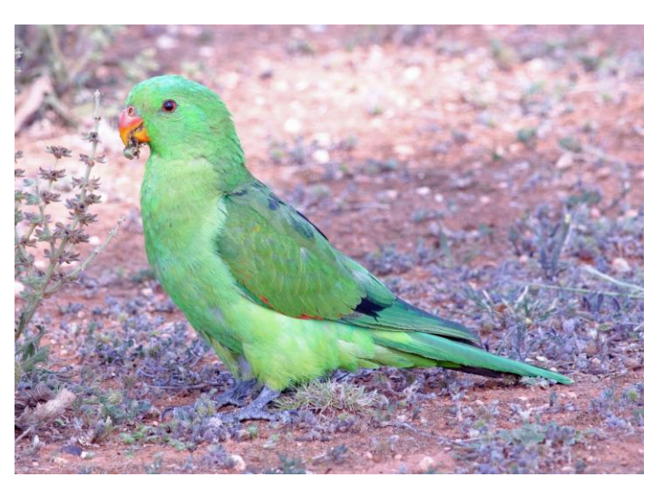
A pair of Red-winged Parrots were feeding on an introduced weed Wild Sage. Native birds are relying more heavily on introduced species.

Blue Bonnet White plumed Honeyeater Striped Honeyeater Restless Flycatcher Peewee Major Mitchell's Cockatoo Red-winged Parrot