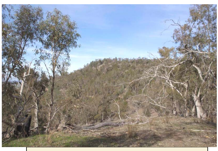
View of the southerly peak from the saddle showing a sandstone outcrop