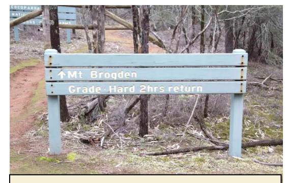
We questioned the 'hard' grade but then it did take us 3.5 hours – not bad for Field Nats

lunch at the cars we made a quick walk to the base of Mt Binya before facing the drive out. Fortunately, we all made it relatively unscathed and were pleased when we got back onto the Whitton Stock Route Road and