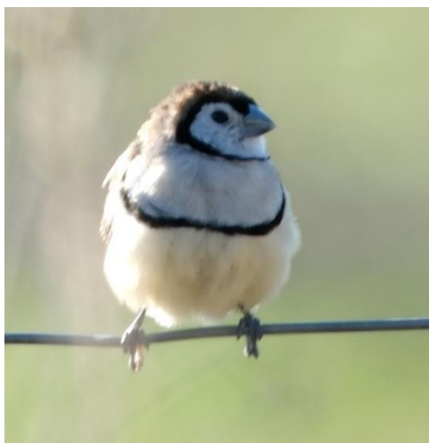
Above right: Naismith Hill Left: Spiny-cheeked Honeyeater Below left: Double-barred Finch (right): Jacky Winter

Galah Australian Raven Yellow Thornbill Australian Magpie Jacky Winter