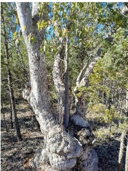
A Kurrajong growing inside the base of a Bimble Box, along the Mad Mile TSR – Glenn Currie