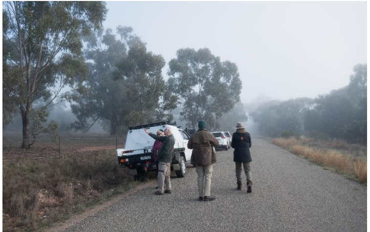
Above: Rowena photographing bracket fungi on a tree stump (Janet Hume); Evans Smyles Road (Rowena Whiting), Below: (left) junction Mirrool Road and Boundary Road (Rowena) (right) north end Boundary Road looking south (Eric Whiting)

Mirrool Creek waters spill over this stretch to continue along Little Mirrool Creek. Scattered Boree trees are all that is left of