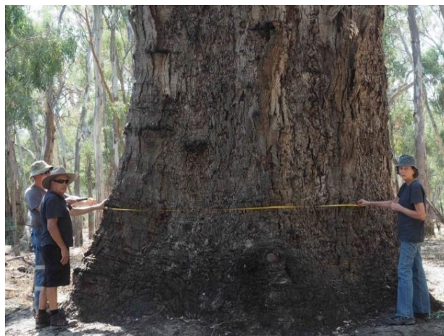
Measuring the River Red Gum in 2019