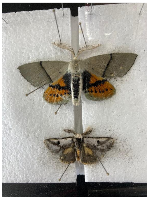
Above: Beautiful Leaf Moth (male), Gastrophora henricaria , at wingspan 3cm. Left: Looper caterpillar (baby Geometridae Moth)

It will be important for records (with photos) to be submitted for our Murrumbidgee region, even though we have few species compared to Australia's East Coast and Great Dividing Range. There's no reason why the same butterfly photo couldn't be submitted to both platforms, at least until users work out their long term preference.