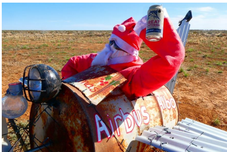
Top: Santa out west. Left: Roos enjoyed the thunderstorm

We also stayed overnight at Mungo ... a very warm overnight, and we had the place to ourselves.