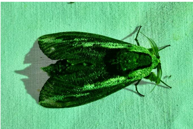
From top: Purple Wave ( Idaea inversata ), a Geometridae Moth (female) - wingspan 1.5cm Geometridae Moth (male) - wingspan 2cm. Geometridae Moth (female) - wingspan 1-1.5cm. (left) Wood Moth, Cossidae (male) - wingspan 10cm