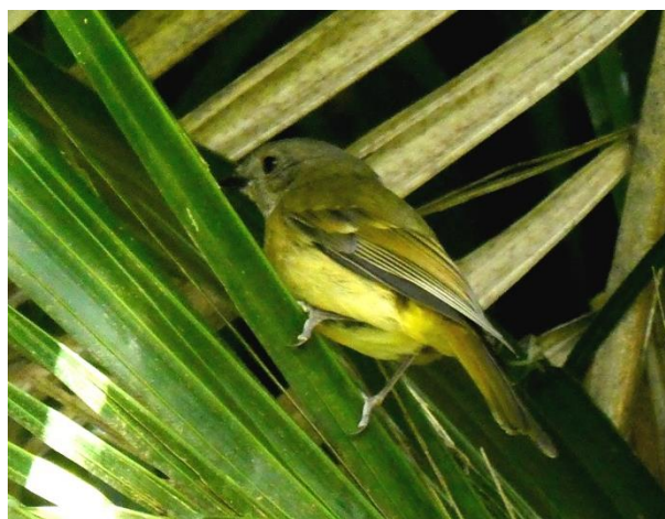
Clockwise from top: New stands of Norfolk Pines, Norfolk Pine seedlings au naturale, Norfolk Golden Whistler was always in the gloom, The White Terns are pure white, Red-tailed Tropicbird doing circlework.