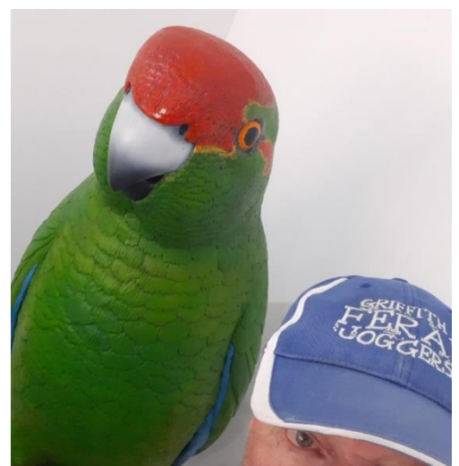
Norfolk Parakeet is easiest to find inside the Parks office