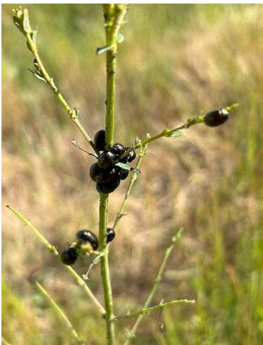
Mistletoebird's nest Chrysolina Beetles Diamond Firetail