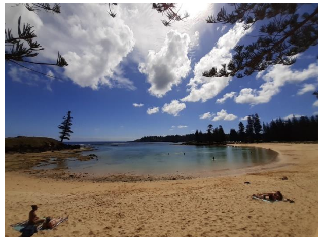
Emily Bay, here be reef, coral and fish

Of the ferals, the California Quail were everywhere, as were the feral chooks which apparently are reverting to their ancestral type the Red Junglefowl. I have never seen so many Sacred Kingfisher. The Black Ducks were almost all hybrids with the Mallards. Song Thrush were easy to see, which was good because apparently they are around Melbourne, but I can't find one. All up I scored a trip