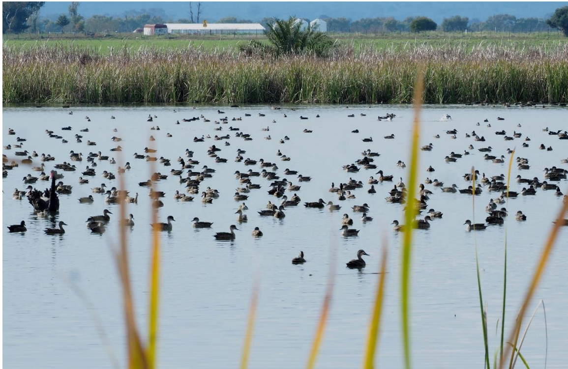
Waterfowl at Fivebough Wetland Sewage Ponds

To facilitate and promote the knowledge of natural history, and to encourage the preservation and protection of the Australian natural environment, especially that of the Murrumbidgee River Valley