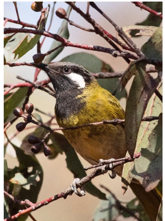
Taller Mallee Eucalypts and wattles in the mining area (top) Rowena Whiting Juvenile Yellow-plumed Honeyeater Graham Russell (left) White-eared Honeyeater Graham Russell (above)

Black-faced Cuckoo-shrike Galah Eastern Yellow Robin Spiny-cheeked Honeyeater Shy Heathwren