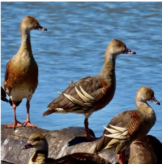
Plumed Whistling Ducks in their hundreds, on dam on McCracken Road off Fivebough Road, Leeton – Paul Maytom

Adults on nest and nest building, pairs accessing 3 different hollows