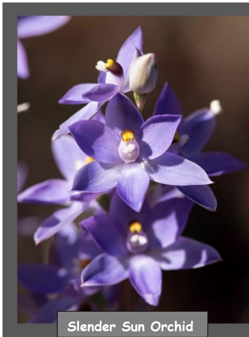
Slender Sun Orchid

To facilitate and promote the knowledge of natural history, and to encourage the preservation and protection of the Australian natural environment, especially that of the Murrumbidgee River Valley