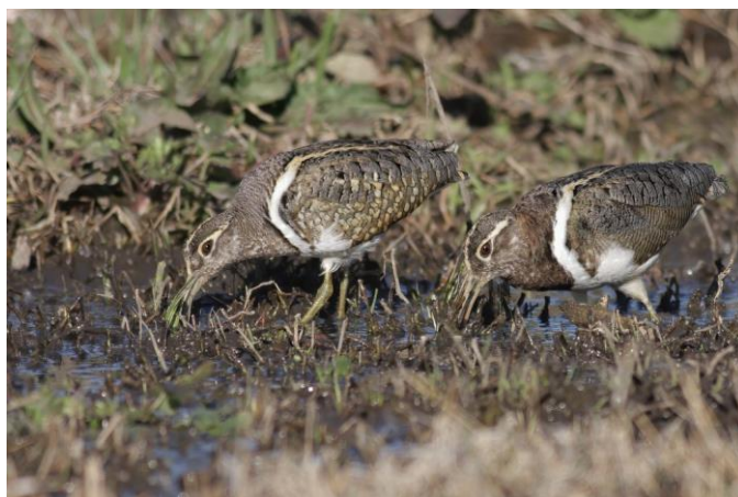
Two male Australian Painted Snipe feeding

Unfortunately, the APS is not one of the "lucky 22" bird species prioritised for funding under the National Threatened Species Strategy. The Twitchathon funds are much needed and will help give APS the attention they deserve.