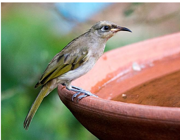
in Leeton 2016

Just at the point when you believe you are familiar with the birds in your surroundings, an unfamiliar call betrays the silence and gets you excited... his call was a delightful combination of twittering, chattering, and tinkling little bird sound I had never heard before. I followed the call to a large dense tree nearby but couldn't, locate the songster.