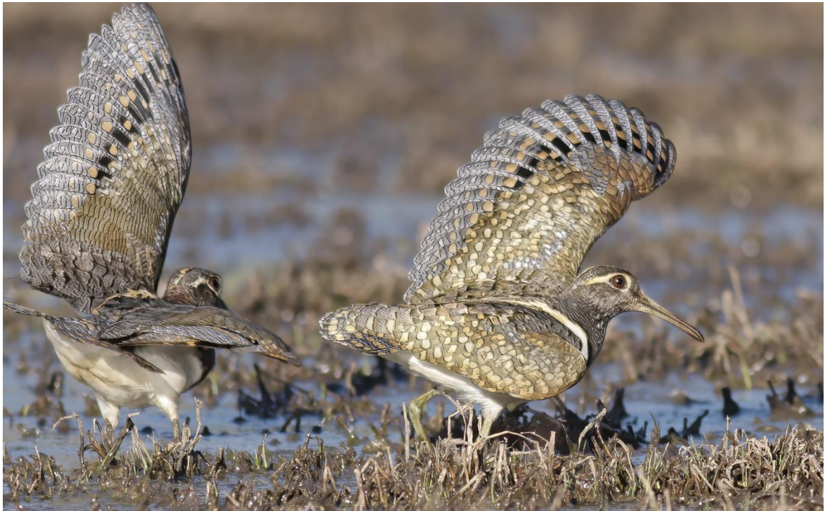
Australian Painted-snipe by Leo Berzins

To facilitate and promote the knowledge of natural history, and to encourage the preservation and protection of the Australian natural environment, especially that of the Murrumbidgee River Valley