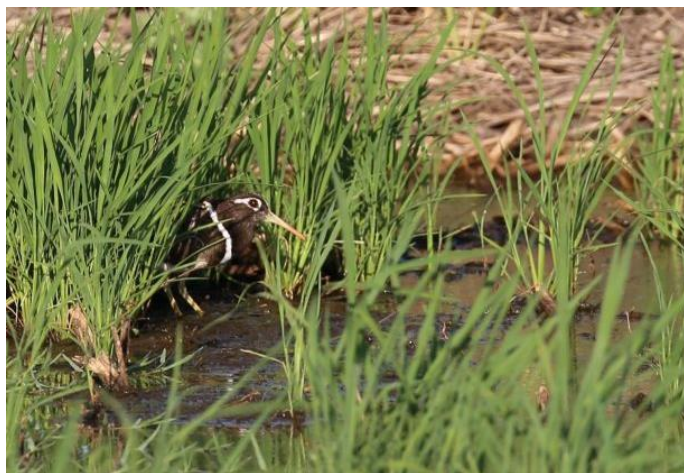
Australian Painted-snipe