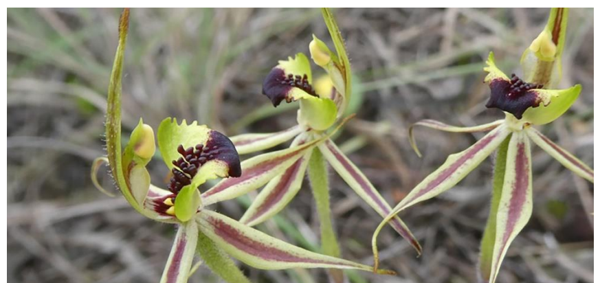
Photos: from top A typical patch of Adders Tongue A plant with three leaves and three stalks, they can have up to five; the stalk with its spore bearing cups (right); Green Spider Orchid