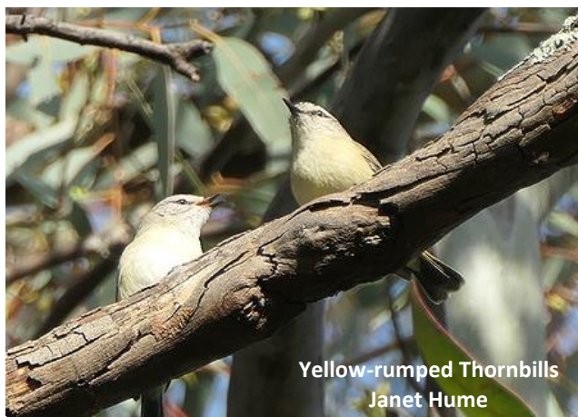
Yellow-rumped Thornbills