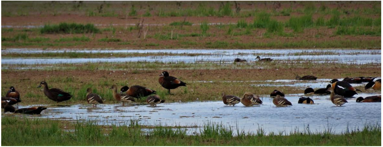
Plumed Whistling and Australian Shelduck (above) / Wood sandpipers (below) both taken at Fivebough