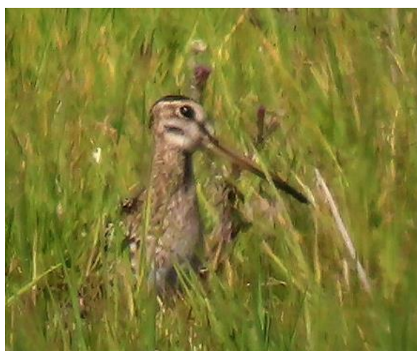
Banded Lapwing (left), Latham's Snipe (right)

The best time for visiting the wetlands is in the morning around 9am to check if any birds have turned up overnight, like migratory waders or in the late afternoon after 5pm (now that we have daylight saving) when birds accumulate in the eastern open area beyond the Brolga sculptures before flying off for the night to feed in adjacent farmlands.