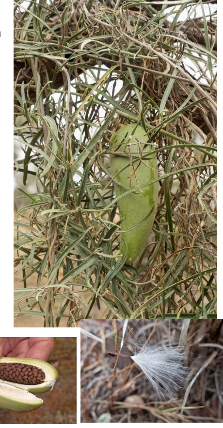
Issue #265 November 2018

View of the block with Casuarina, Rosewood, (above) Bush banana showing the seed pod and a released single seed with a 'fan' to assist blowing it away – Rowena Whiting