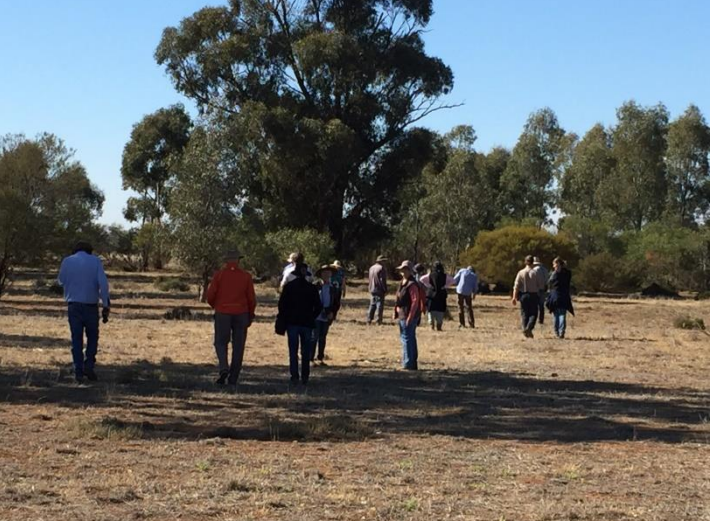
The Murrumbidgee Naturalist