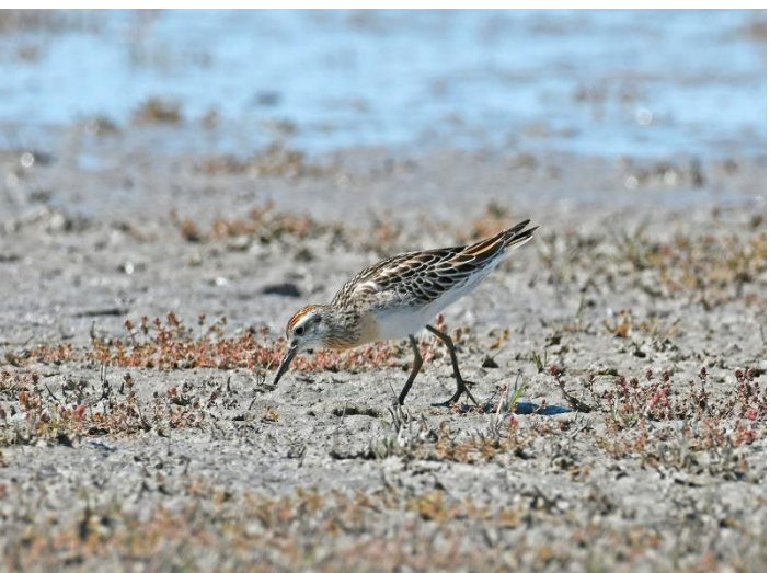
Sharp-tailed Sandpiper – Mal Carnegie

Muehlenbeckia florulenta (Lignum) occurs in dense thickets to the north of Lake Cowal and form the basis of the breeding habitat for many water birds. Open areas without Lignum tend to be covered by Marsilea drummondii (Nardoo) and Myriophyllum verrucosum (Water Milfoil) when the Lake is inundated. These conditions provide ideal breeding conditions for thousands of Pelican, White Ibis and feeding conditions for many waders. Fourteen birds seen here are listed as threatened species. So we went to have a look.