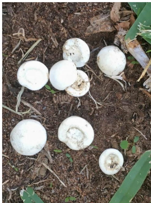
Ellené’s photo of her gastroliths