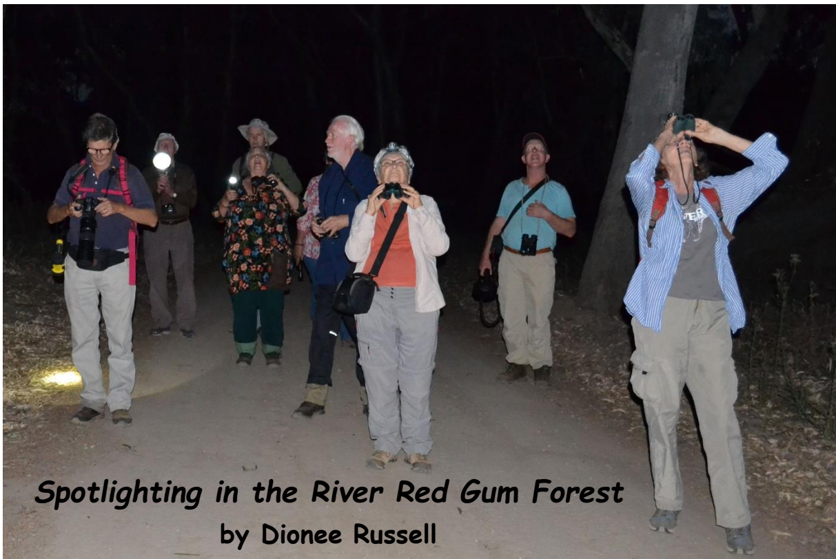
Spotlighting in the River Red Gum Forest

To facilitate and promote the knowledge of natural history, and to encourage the preservation and protection of the Australian natural environment, especially that of the Murrumbidgee River Valley