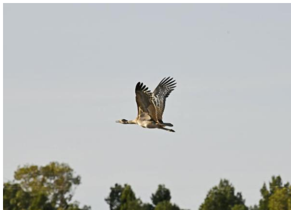
Australian Bustard near Lake Cowal