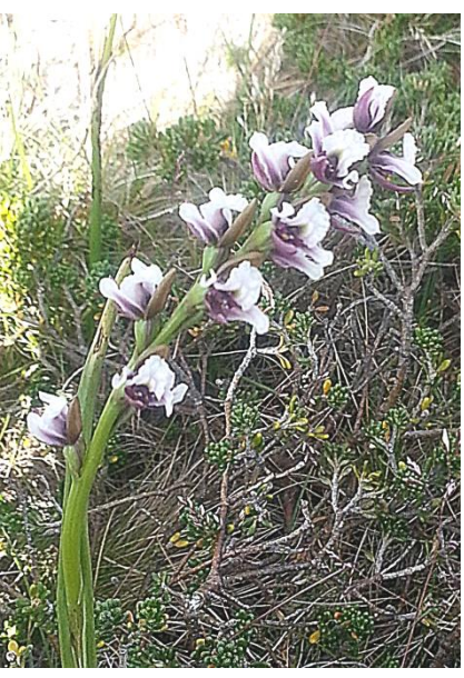
Photos above Pretty Valley trail & pondage, Sun-veined Orchid, Mauve Leak Orchid,

Silver or Snow daisy Celmisia longifolia , common Billy Buttons, Snow Buttercups Ranunculus niphophilus across the tall herbfields.