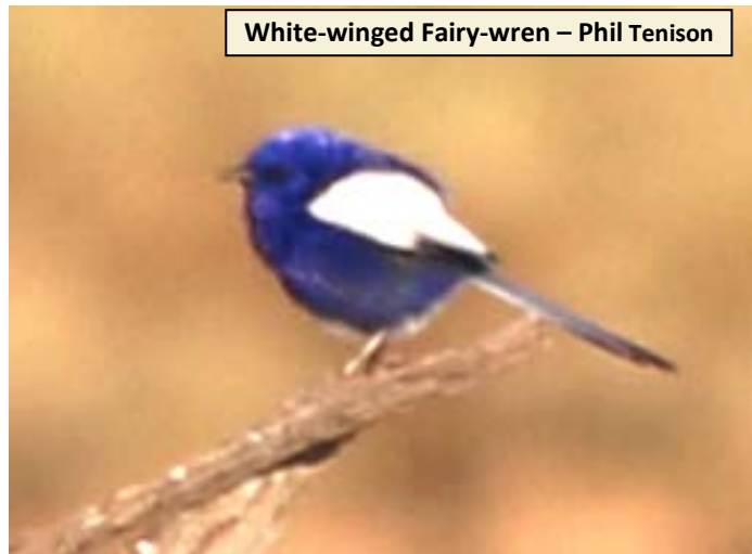
White-winged Fairy-wren

Out in Tuckerbil itself, we got onto the wrens and they were very cooperative in allowing Phil to get close enough for a reasonable photo. Also, there were several Golden-headed Cisticolas feeding in the plants alongside the wrens.