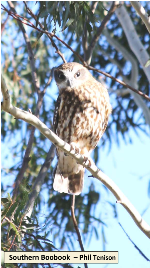
Southern Boobook – Phil Tenison

I was initially keen to check out the very dry Tuckerbil Swamp in case the Blue-winged Parrots had returned for the winter – not as yet but I did locate a family of White-winged Fairy-wrens with a fully coloured male showing well on top of a dead boxthorn bush. I told Phil and Kathy about seeing them and we organised to go out to Tuckerbil on the next weekend to search for them so Phil could get some photos. On the way through the entrance to Koonadan Historic Site we inadvertently flushed a large bird that flew out and landed in a nearby gum only to be attacked by