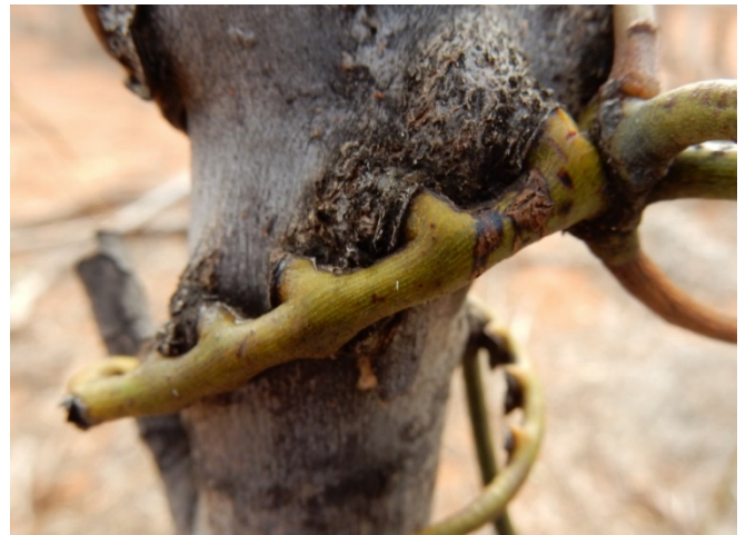
Mallee Strangle-vine attachment to host (above) Mallee gum barks showing their colours (below)