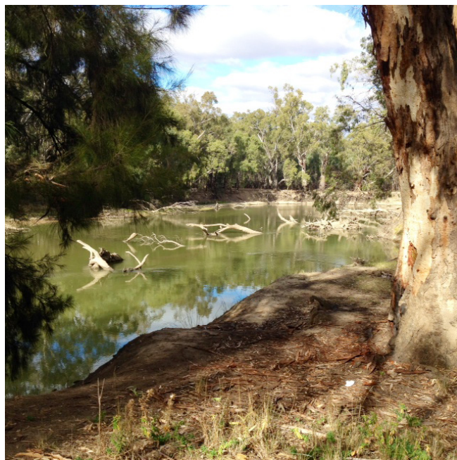
A low Murrumbidgee River