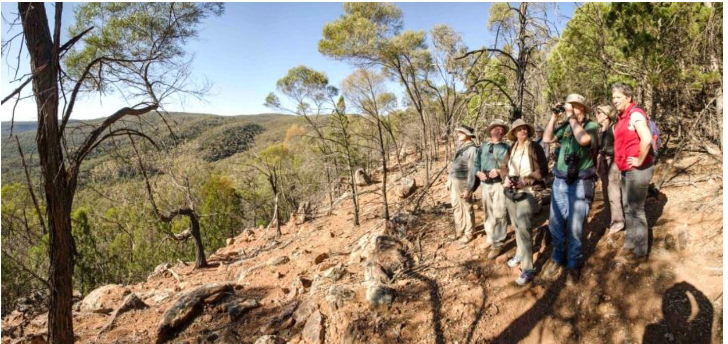
Enjoying the view from Ironbark ridge, Cocoparra National Park

To facilitate and promote the knowledge of natural history, and to encourage the preservation and protection of the Australian natural environment, especially that of the Murrumbidgee River Valley